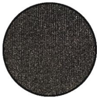
Hook Sensitive Fabric