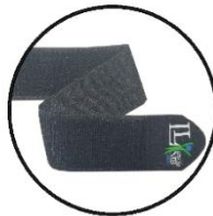
Strapping Stretches For Soft Compression