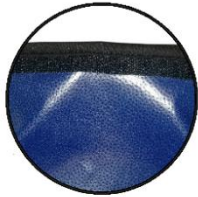
Waterproof Barrier Easy Open Case