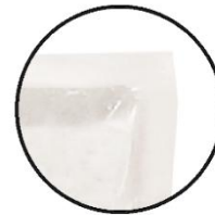
4 Mil Thick Eco-Friendly Plastic With 1/2" Seam