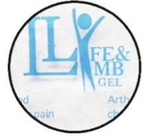
Easy To Use Directions Printed