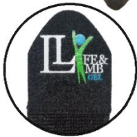
Hook Sensitive Strapping For Easy Adjustments