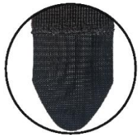
Low Profile Hook