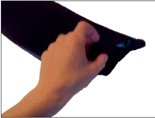
1) Keep strapping attached when not in use